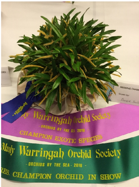
RESERVE CHAMPION & CHAMPION EXOTIC SPECIES – DENDROCHILUM PULCHERRIMUM GROWN BY A. SULFARO