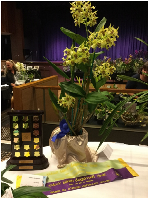
GRAND CHAMPION & CHAMPION AUSTRALASIAN NATIVE HYBRID – DEN. NEIFERT'S EXCEPTION GROWN BY PHIL & YVONNE SPENCE