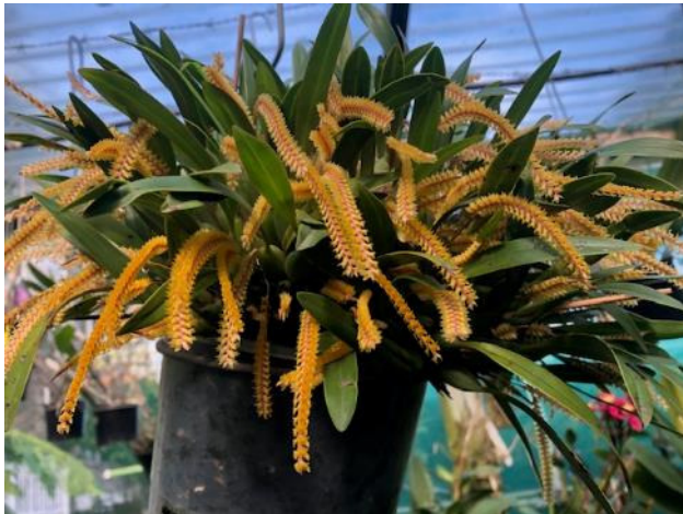
Angie's Dendrochilum pulcherrum