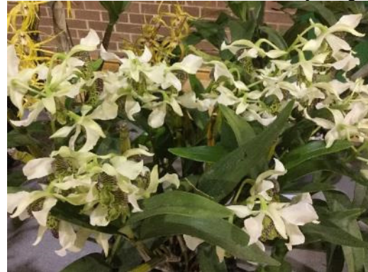
Dendrobium engage x rhodostictum

HYBRID OF EVENING Grown by Angie Sulfaro