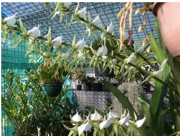
Angraecum eburneum grown by Tinka. This plant has four spikes and is getting too big to take to shows.