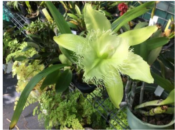
Brassavola digbyana grown by Tinka