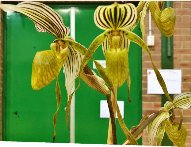
Hybrid grown by A & G. Cushway Paphiopedilum Temptation A primary hybrid between Paphiopedilum kolopakingii and phillipinense it has inherited the more desirable traits of both to produce a superior multifloral plant, with intricately detailed and strikingly coloured flowers.