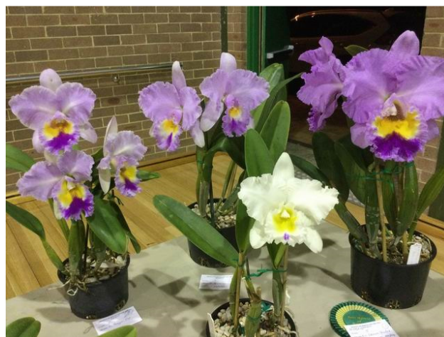
Catts. Grown by the Cushways