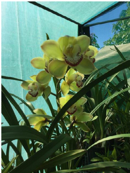
Cym. Valley Den Hoogenband X Zenation Debbie – Tinka