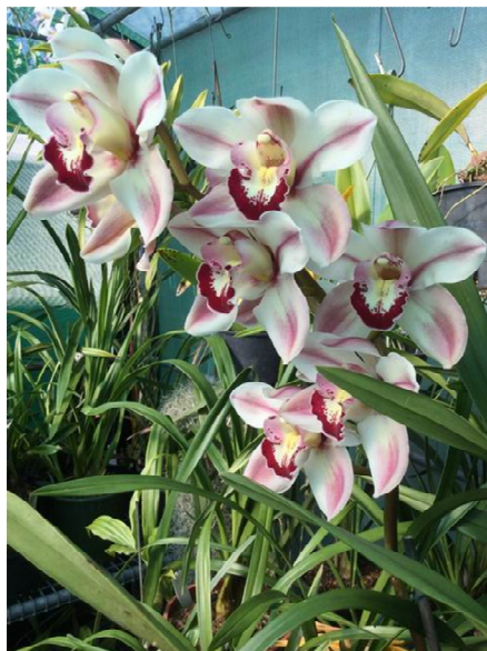
Cym Kimberley Splash 'Teepe' -Tinka