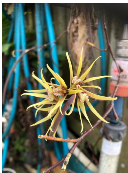
Dolichophylla - Cary