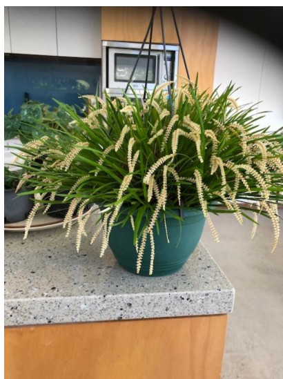
Dendrochilum stenophyllum - Cary