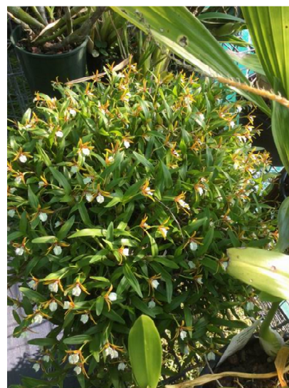
Encyclia polybulbon - Tinka