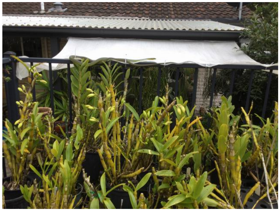
Had a slippery visitor this morning. It was laying on top of the fence and I had to look twice as at first it was stretched out with its head erect about 20cm tall and two little dark eyes. It saw me and turned around and slid off to visit the neighbours. Maybe a green tree snake? Looked about two metres long, and skinny.