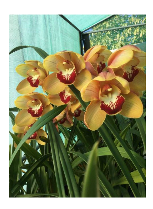
Cym. Harbor City x Foxfire Orange 'Crush'