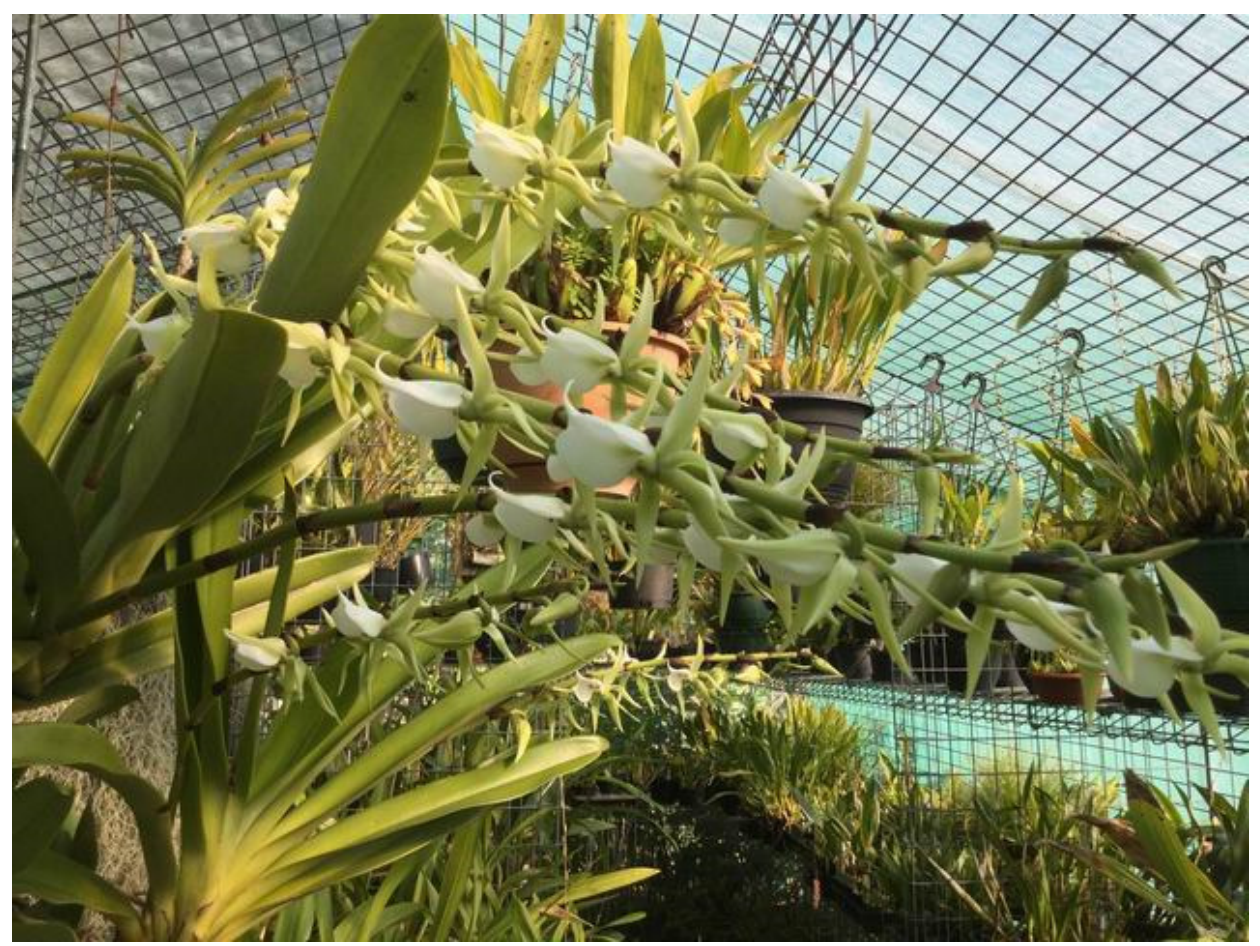
Angraecum eburneum Six spikes this year. Very top heavy and has quite a lean.