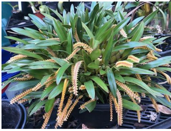
Dendrobium grown by Emilia

Dendrochilum pulcherrmum – grown by Angie