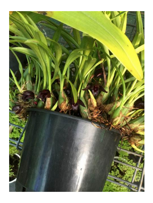
Maxillaria skunkeana 'Kingston' This plant has been flowering for five months.