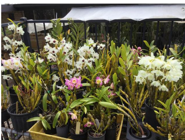
Dendrobium soft canes now flowering