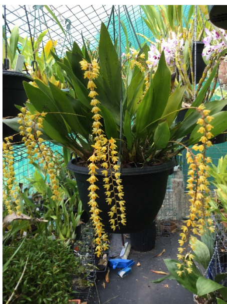
Dendrochilum cobbianum 'Royale Gold'