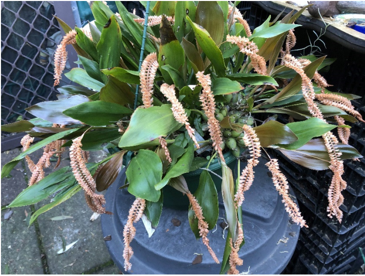
Dendrochilum convallariforme – grown by Angie