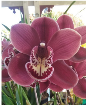
Kulnura Ruby Red Velvet