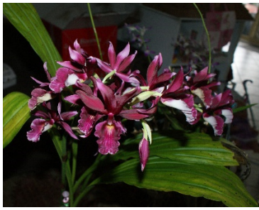
Phaiocalanthe Kryptonite 'Parkside'