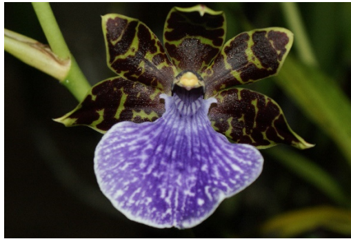
Zygoneria (Zga.) Adelaide Original X