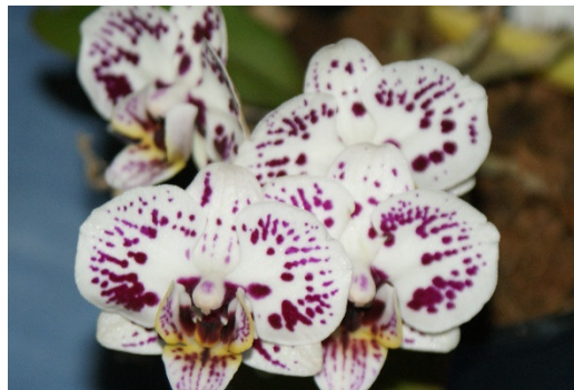
Phalaenopsis Lioulin Berry