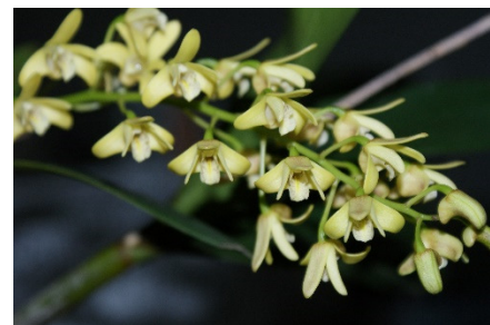
Dendrobium gracilicaule howeanum