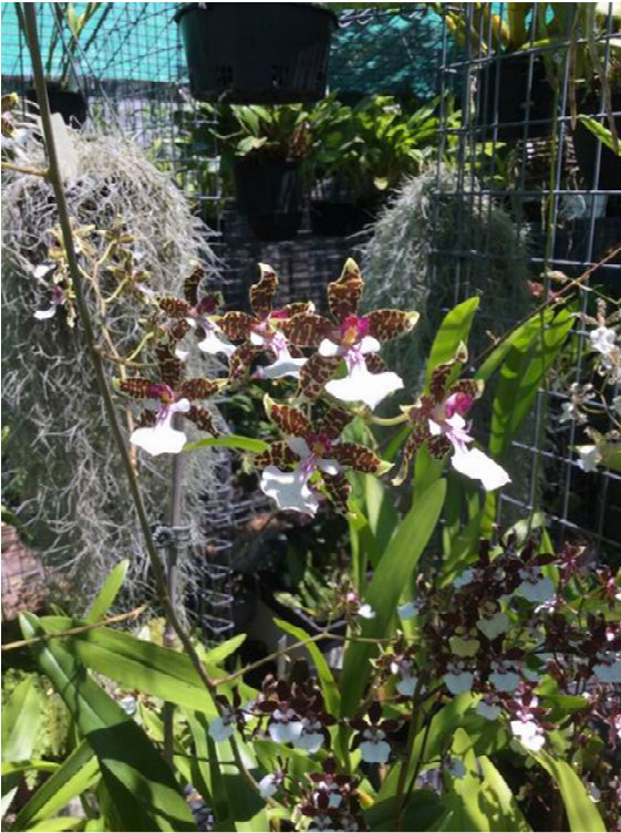
Oncidium pardothyrsus . May have wrong label as photo in Jay's Internet Encyclopedia shows a brown and yellow flower.