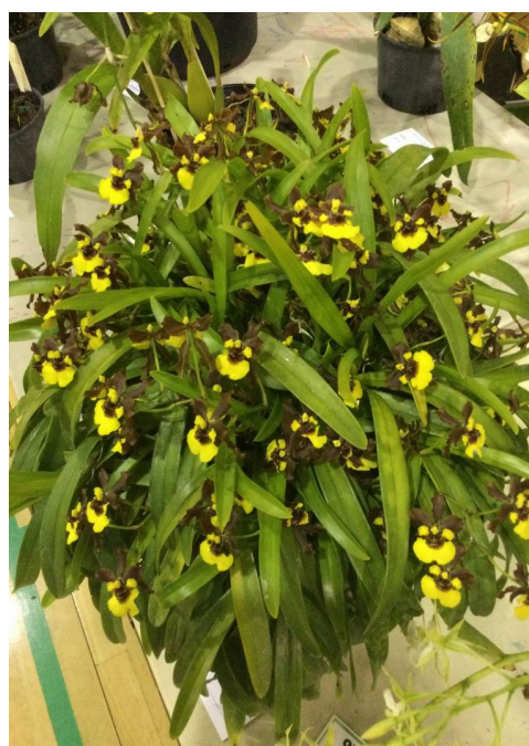
Species of Evening - Oncidium croeses grown by Angie Sulfaro