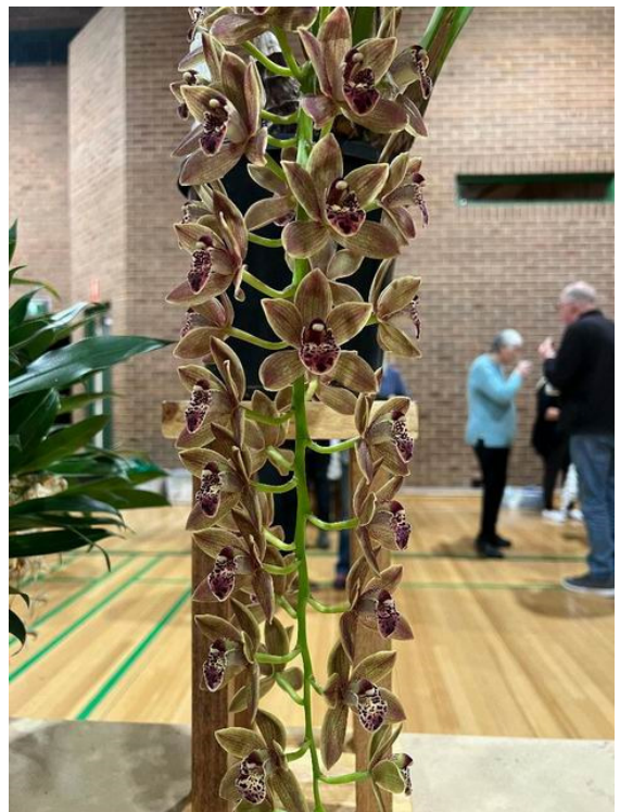
Novice of Evening Cym. Bulbarrow 'Waikanae'